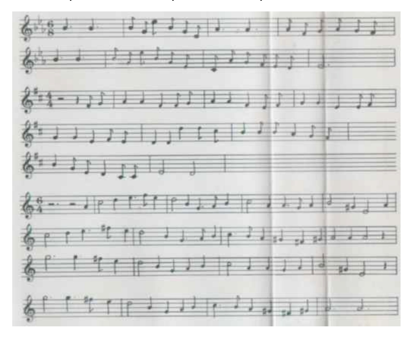
Try out these three tunes on your Music Maker. They should sound familiar!